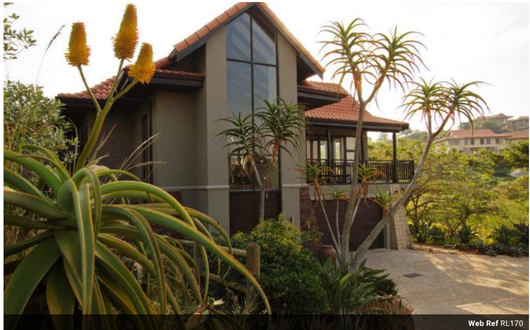
Web Ref RL170